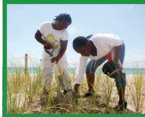
Sea oat planting with Minority Development & Empowerment campers