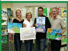
"Kids Go Green" contest judges hold up winning posters