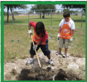
Mahogany tree planting at Carol City Elementary in Miami-Dade